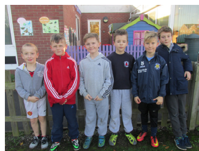
Year 4 boys