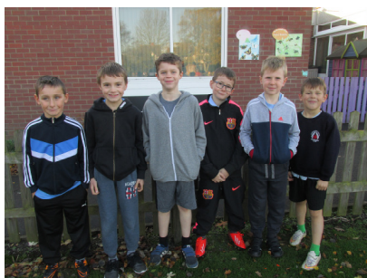
Year 3 boys