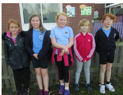
Year 4 girls