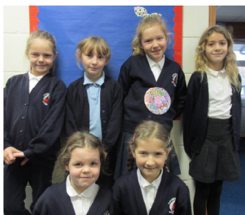
Year 3 girls

Well done to all the children who took part you did the school proud.